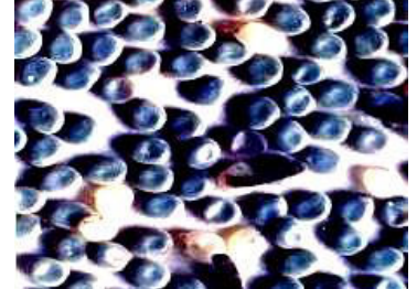
Initiation of hatching