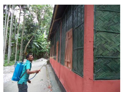
Outside the rearing house