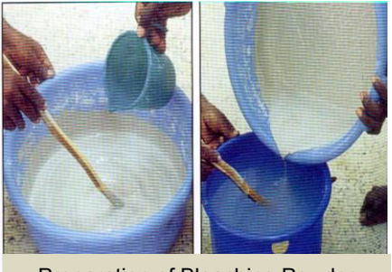
Preparation of Bleaching Powder paste & mixing the paste with water

• Cover the bucket with a lid and keep the mixture undisturbed for 15 minutes to settle down the un-dissolved matters.