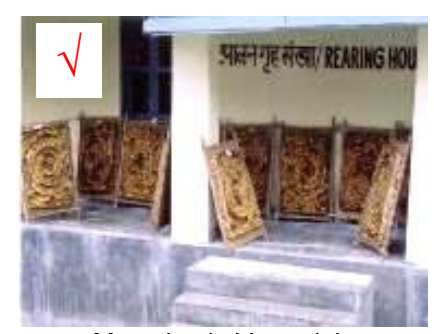
Mounting in Verandah