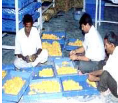
Harvesting of cocoons